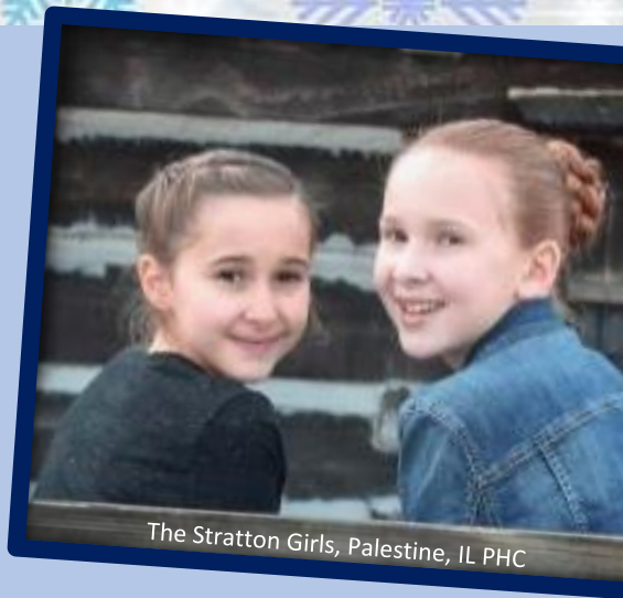
The Stratton Girls, Palestine, IL PHC