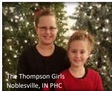
The Thompson Girls Noblesville, IN PHC